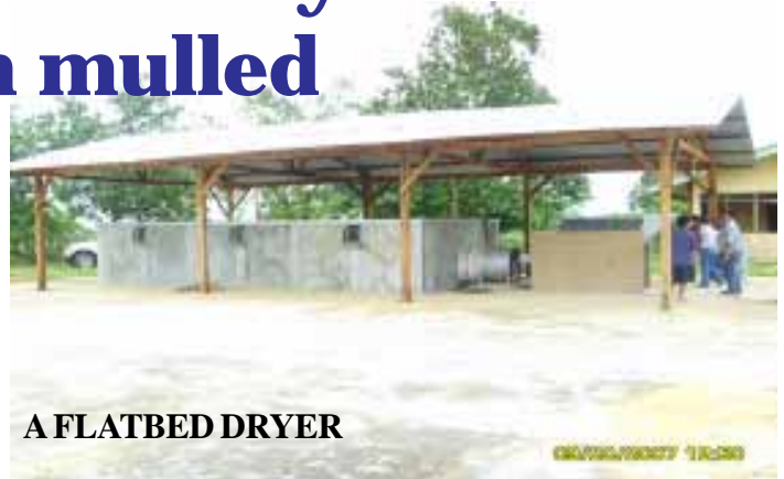
A FLATBED DRYER

The grains conference was organized around the theme: biomass utilization for profitability. There were 200