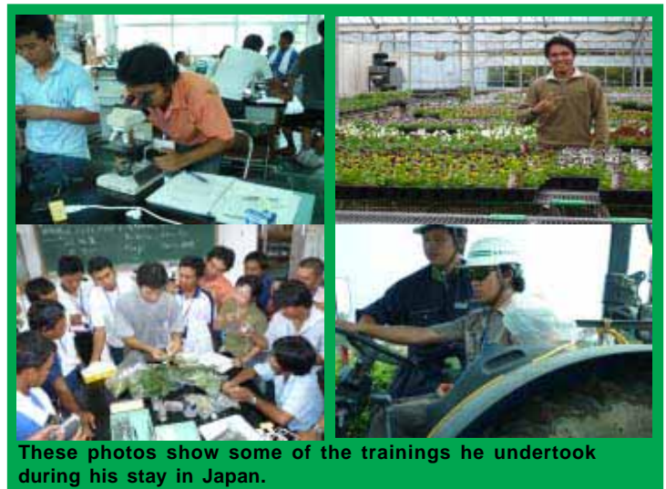
These photos show some of the trainings he undertook during his stay in Japan.