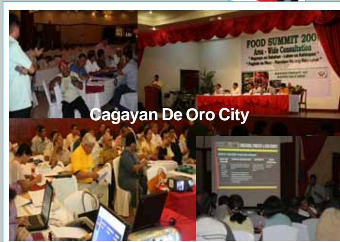
Cagayan De Oro City