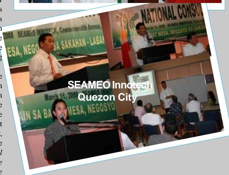
SEAMEO Innotech Quezon City

He relayed that he requested an augmentation fund and was given P2.8 billion for a