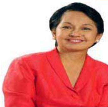
Her Excellency President Gloria Macapagal Arroyo

"I want to convene a food summit, organized by DA to enhance policies and programs, attract investments and technology, and launch development projects that would impact favorably on energy and food supplies and prices in the medium term, while helping significantly arrest climate change. The food summit would be the platform for our rural development thrust."