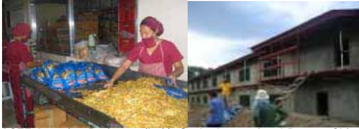
ACEF On-going Projects: (Left) See's International Banana Chips in Bulacan and (Right) Gonzales Farm Tunnel Vent Poultry in Urdaneta, Pangasinan.

The Agricultural Competitiveness Enhancement Fund (ACEF) created under Republic Act (RA) No. 8178, technically ended last December 2007. However, due to the clamor of various interest groups from the agricultural sector for the extension of the utilization period of the ACEF, several requests were made both to the Senate and the House of Representatives for a law that would amend RA No. 8178.