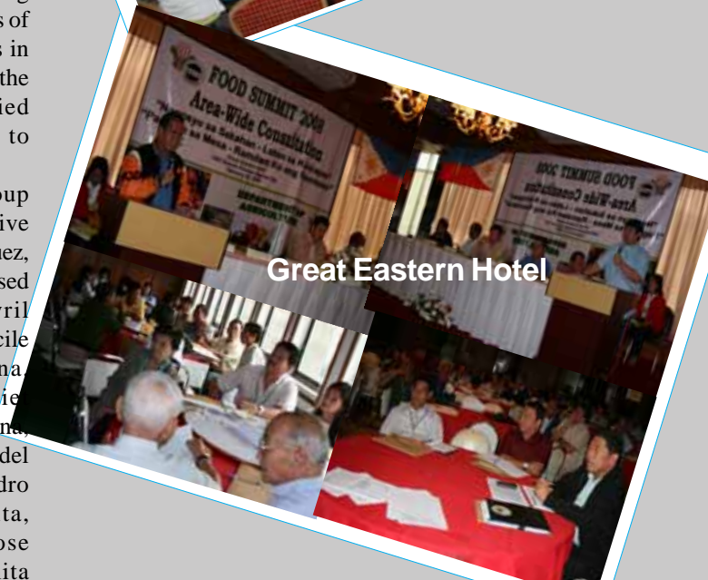
Great Eastern Hotel